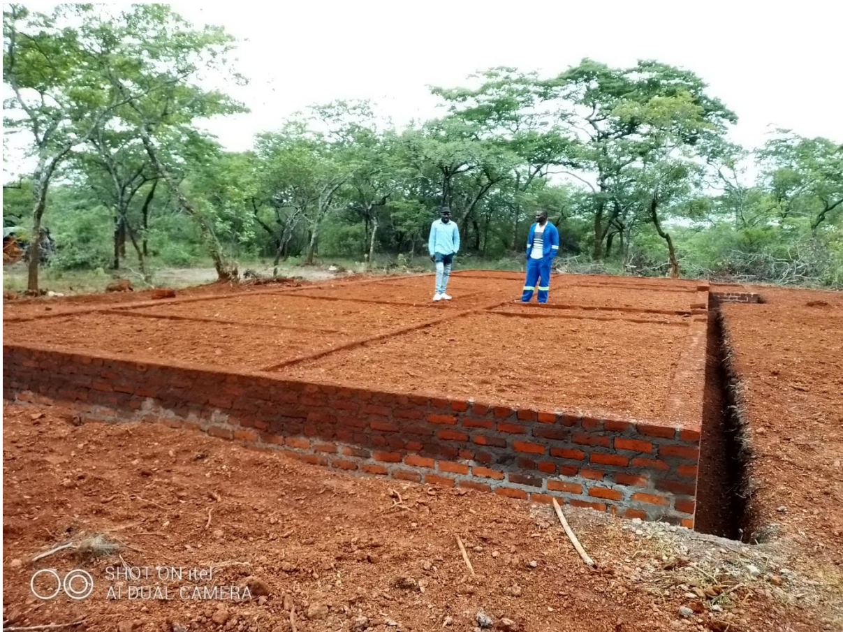
Completion of box and backfilling

The next two stages will be to put the slab and then the construction of the superstructure. Great appreciation to Woodland Oaks for the provision of $3000 towards this effort and the local brethren for doing the same. Besides the list of families who made contributions as presented in the last report, the following families provided the following amounts in the month;