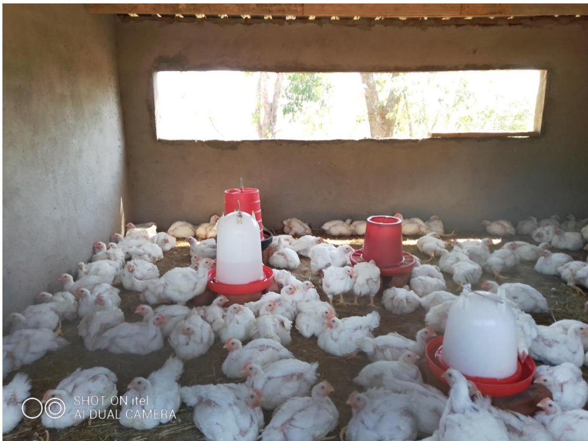
Second batch of broilers ready to be sold

The school's poultry project continued in the month of November. The batch of 200 birds which we started on the 16 th of October began to be sold around the 23 rd of November. Due to the scarcity of chicks, we got a batch of 25 and another of 50 on the 27 th . The former will be ready around the 25 th of December while the latter, around the 8 th of January.